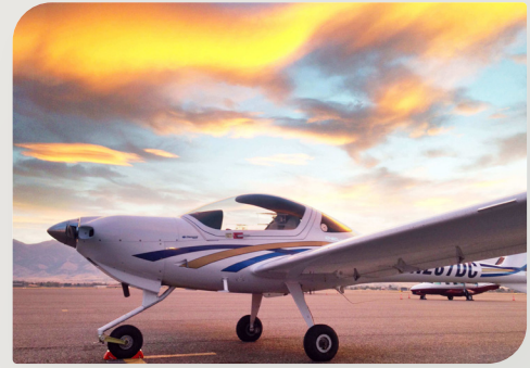
Diamond DA20 Eclipse

Touting a fleet with solid reliability, good all-around performance and better fuel efficiency, we take pride in offering the training aircraft that meets the needs of those just beginning, as well as the most experienced pilot.