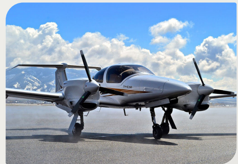
Diamond DA42 Twin Star