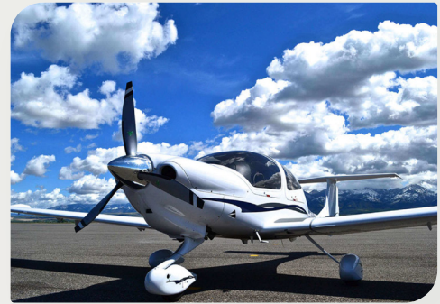
Diamond DA40 Diamond Star